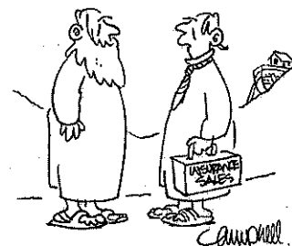
"Flood insurance is very expensive, Mr. Noah, and besides, it would have to rain 40 days and 40 nights to flood around here."